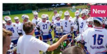
ADEL Refresher Course for Coaches of High Performance