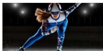
International-Level Athletes Education Program (English)

WADA's ADEL is free and available to anyone and offers a range of e-learning courses, many available in multiple languages. Please encourage athletes, coaches, medical personnel, and other support persons to take advantage of this resource – they simply need to register for a free account.