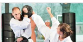
Athlete and Athlete Support Personnel Guide to the List 2025 (English)