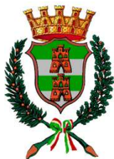
Città di Maniago Città delle coltellerie