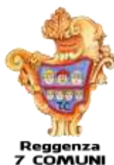
Reggenza 7 COMUNI

Col del Sole Hotel ***Superior Via Chiesa, 52 Treschè Conca di Roana Web: coldelsole.it/en/