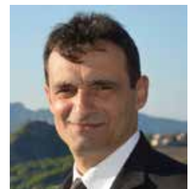
Mauro Giannini Mayor of Pennabilli (RN)