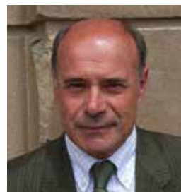
Angelo Francioni Mayor of Carpegna (PU)